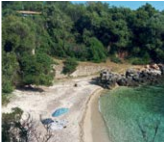
Beach near Paxos View

The Studios : Self Catering Studios for 2 Interconnecting for up to 4 Air Conditioning Free WiFi