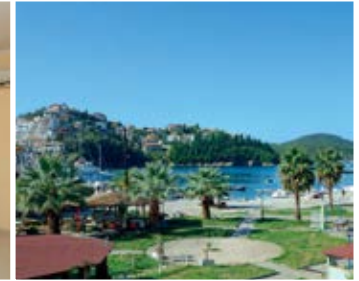
View from Evanti