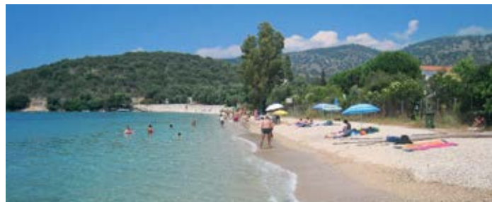
Galikos Malos beach is a 5 minute walk from the harbour

The Hotel: Bed & Breakfast Air Conditioning Free WiFi