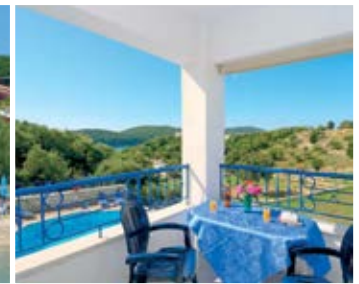
Location of Rodanthi Apartments (arrowed)