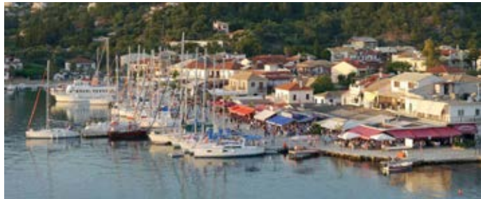
Sivota view from Filakas