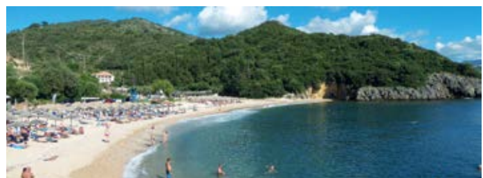
Mega Ammos beach

The Apartments: Bed & Breakfast Apartments for 2/4 Swimming Pool Air Conditioning Free WiFi